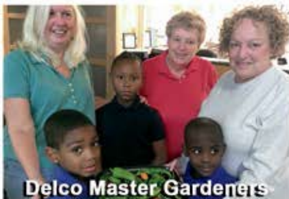
Delco Master Gardeners