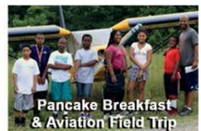
Pancake Breakfast & Aviation Field Trip