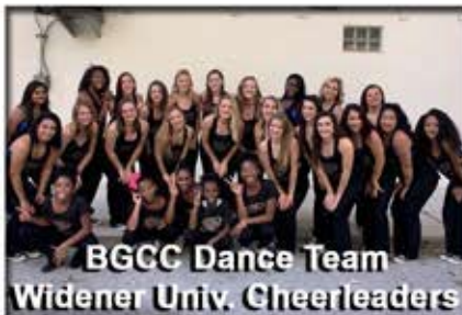
BGCC Dance Team Widener Univ. Cheerleaders