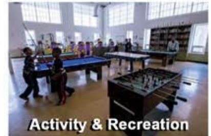
Activity & Recreation