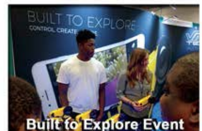
Built to Explore Event