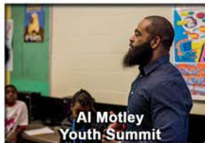
Al Motley Youth Summit