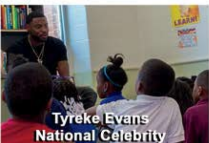
Tyreke Evans National Celebrity