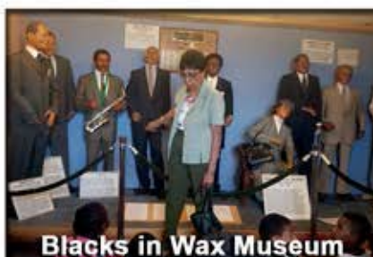
Blacks in Wax Museum